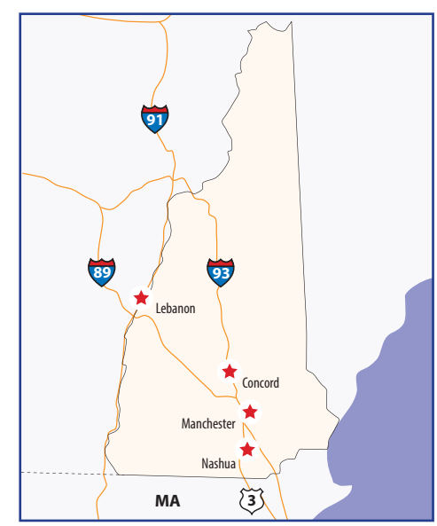
Figure 2: New Hampshire Sites Visited by NDEWS HotSpot Planning Committee Members